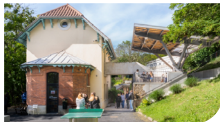
ICOF 8 avenue Debrousse 69005 LYON Google Maps Venue for courses from 14 to 19/07