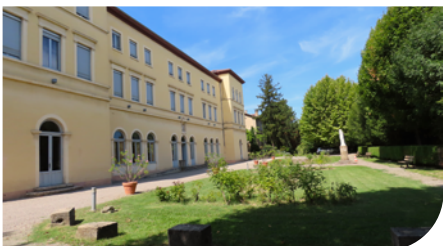
Les Chartreux St-Irénée 10 avenue Debrousse 69005 LYON Google Maps Venue for courses + conferences + concerts from 14 to 19/07