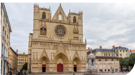
Cathédrale Saint-Jean Baptiste de Lyon 8 place Saint-Jean 69005 LYON Google Maps Venue for the concert on 19.07